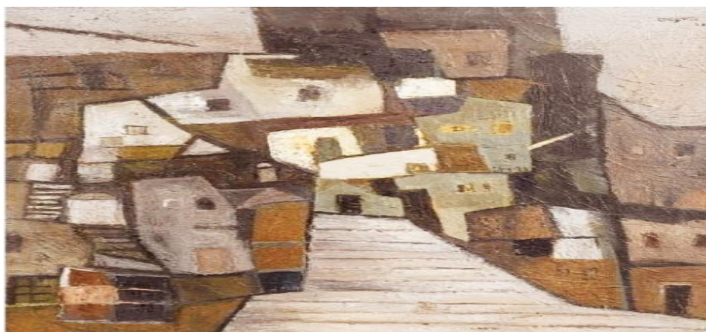
Fig.3 Title-Varanasi, Medium-Oil on canvas, Size-69x58.5cm