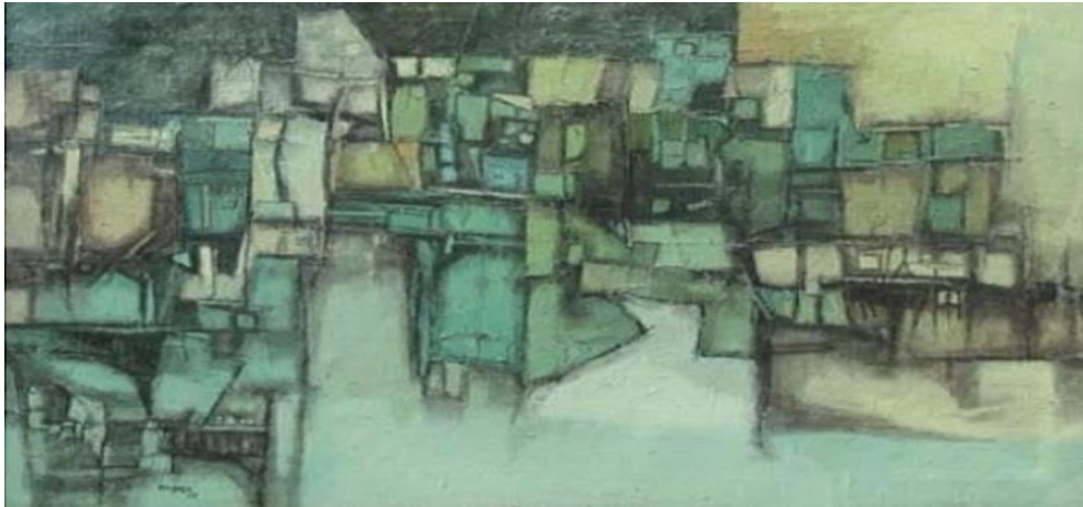
Fig.1 Title-Varanasi 1960,Medium-oil on canvas, Size-94x 134cm

important to develop spiritual thoughts, optimism perspective and vision as he agreed that Banaras is important also for me both as an artist as well as a human being. he collected many no. of the places that he represents on canvas as well on paper with different types of medium and a kind of bird's eye view he destroyed reality and found a new direction for abstract. His experience from ingeniousness had a different kind of language and style which emerged during the painting of Banaras ke Ghat.