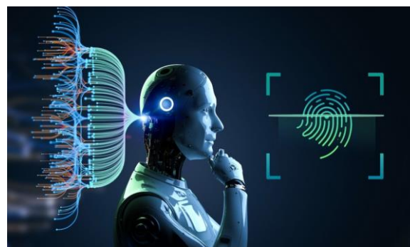
Fig 4 : Artificial Intelligence (AI) Is Used In Biometrics

Technology, AI, and big data play a crucial role in the development of the field of biometric authentication. How are these technologies introduced in the realm of biometric authentication and utilized in this section?