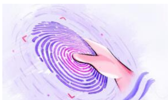
Fig 2 : Biometric technology

Fingerprint recognition is a widely recognized biometric technology that compares a captured image of a fingerprint to the user's known fingerprints stored in the system. Features such as ridge endings, bifurcations, and ridge shape form minutiae to be extracted from fingerprints. Minutiae are recognized for their specific pattern and used for authentication. Depending on the type of data digitally stored in the fingerprint scanner machine, fingerprint recognition techniques could be categorized into two types, namely, the optic fingerprint machine and the semiconductor fingerprint machine. The optic fingerprint machine stores the digitized image of the fingerprint as well as performs the fingerprint matching task on the image, while the semiconductor fingerprint machine uses the model of the fingerprint as pre-processed data and not a model of the digitized image, and hence there would be no need to perform an intensity transformation which leads to space saving and a fast transaction due to employing a smaller digital model for the construction of the fingerprint images.