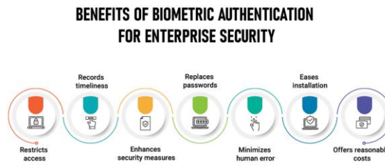
Fig 5 : Benefits of Biometric Authentication