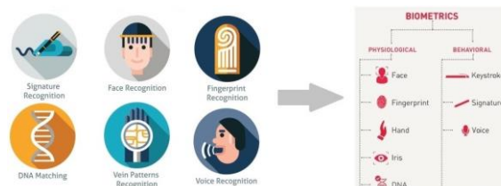
Fig 6 : Biometrics (facts, use cases, biometric security)